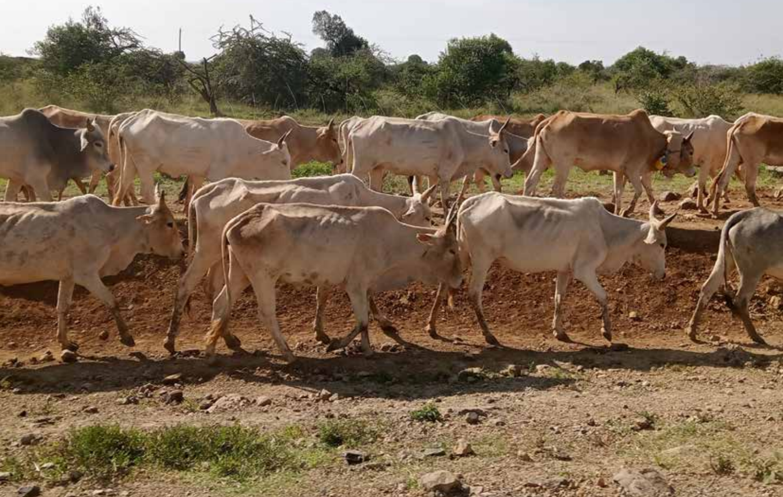
Pastoralists' migrating along Rumuruti-Mararal road reserve during 2021-23 severe drought.